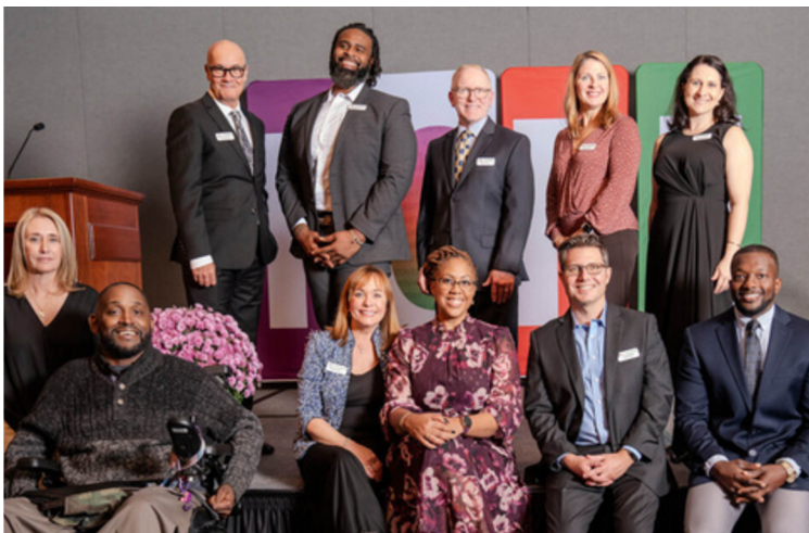
Members of the County of Summit ADM Board of Directors